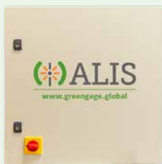
500W 1-Channel Order No: ALS0010