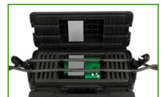
ALIS patented inductive power technology.

In comparison to legacy lighting systems, such as CFL and fluorescent, ALIS yields energy savings between 50% and 90%.