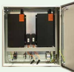
1000W 2-Channel Order No: ALS0006