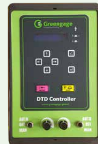
V1.8 Model No: ALS0049