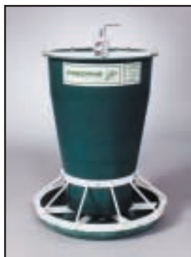
Model RN4 1 Bushel/35 Liter Feeder

carefully designed for each size range to reduce stress and promote consumption.