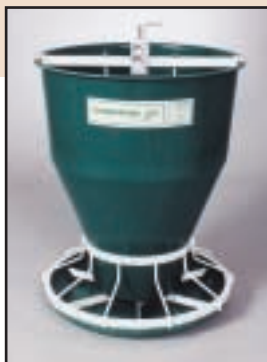
Model RN3 3 Bushel/106 Liter Feeder This intermediate Big Wheel Feeder takes about 40 pigs from 2 weeks to 65 lb (29.5 kg). Works well in fenceline installations with optional Big Wheel Fenceline Adapters. Trough diameter is 22 in. (55.9cm), height 30 in. (76.2cm).

Our smallest Big Wheel Feeder is sized right for pre-nurseries and is ideal for use in the dividers between crates or in fencelines with our optional Fenceline Adapters. This model is designed to serve approximately 25 pigs from 10-days-old to 35 lb (15.9kg). Trough diameter is 18 in. (45.7cm), height 24 in. (61cm).