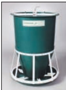
Model RN1 4.5 Bushel/159 Liter Feeder The largest of our nursery feeders, the RN1 serves about 60 head from 2 weeks to 80 lb (36.3kg). The 26-inch-diameter (66.0cm) trough is designed for larger nursery pigs. Height is 36 in. (91.4 cm).