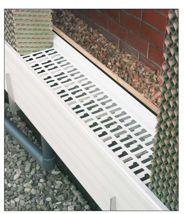
Water reservoir for up to 48 litres per running metre water capacity

As an optional feature we offer an extended centre coupler. It facilitates maintenance as it provides easier access to the float valve.