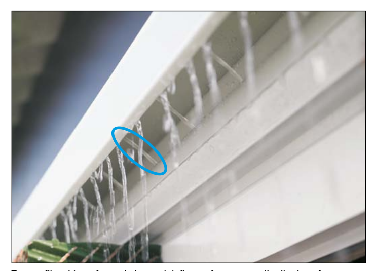
Top profile with perforated pipe and deflector for an even distribution of water along the pads