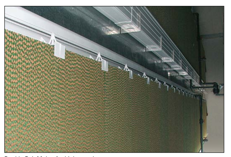
Double RainMaker for high cage houses