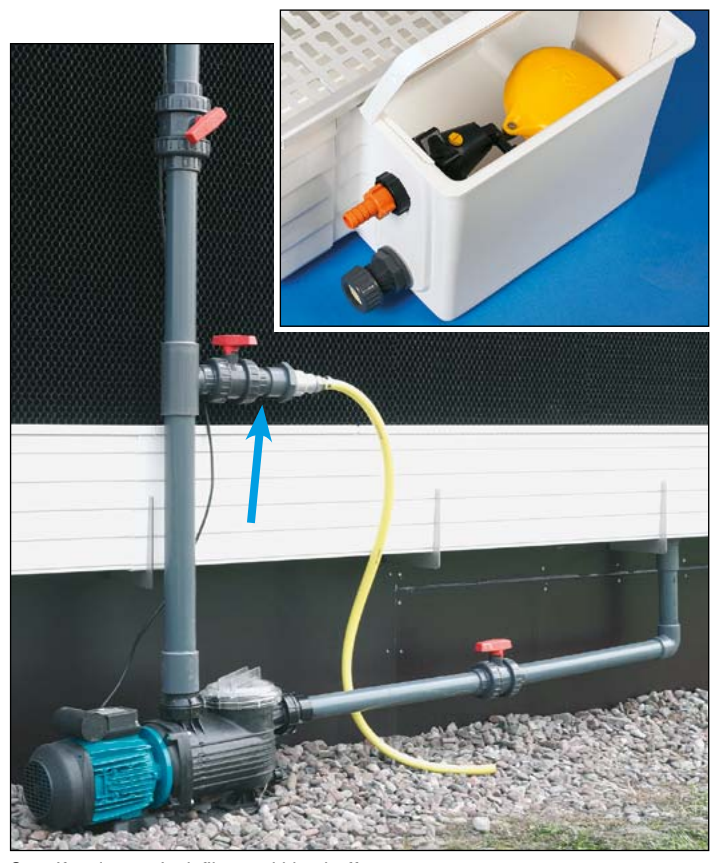
Centrifugal pump incl. filter and bleed-off