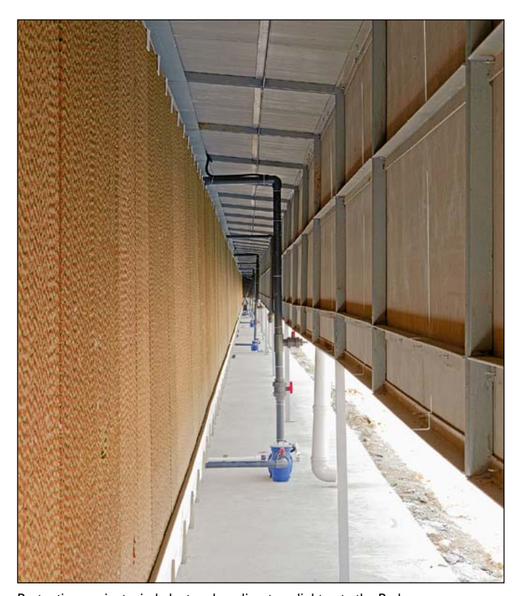
Protection against wind, dust and no direct sunlight onto the Pad