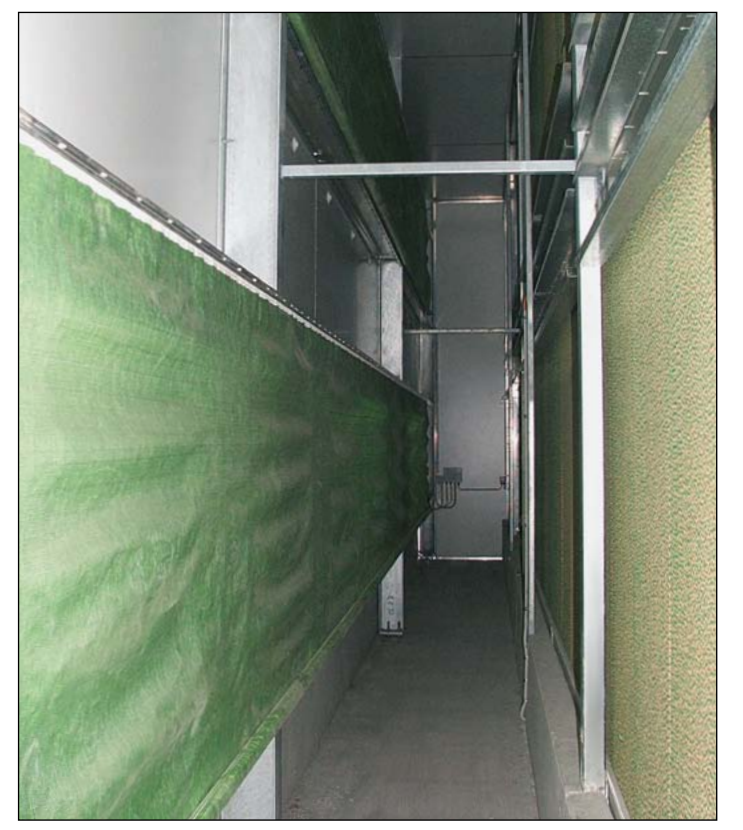
Tunnel inlet with roller curtain