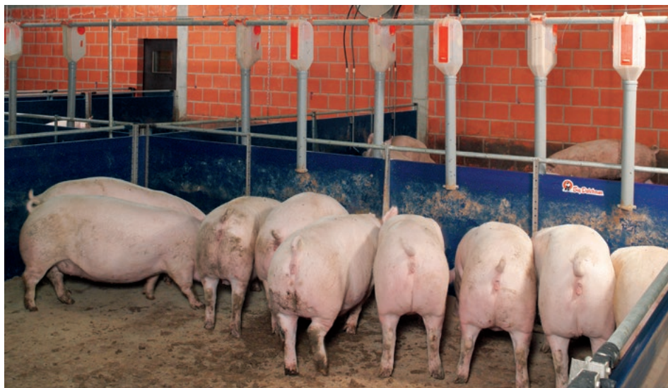
Simple trough feeding systems in small groups, ideally with shoulder divisions. These can be fed by liquid or dry feeding systems.