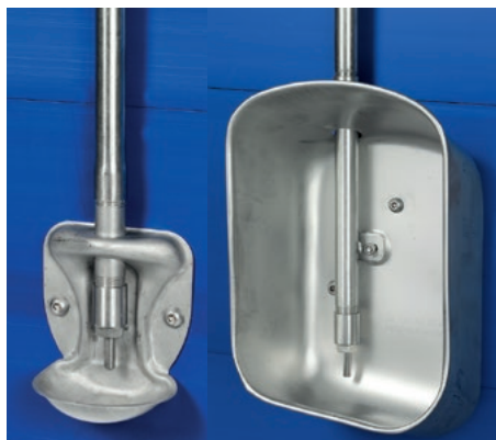
Drinking bowl for suckling piglets and finishing pigs

The provision of fresh and clean drinking water is extremely important to ensure the health of your livestock. Thus, a sufficient amount of clean water within easy reach of the pigs is essential. Big Dutchman satisfies these requirements for an animal-friendly keeping of pigs in an ideal manner by offering a wide range of different drinking systems. Our product range includes nipple drinkers and drinking bowls for sows, piglets and finishing pigs.