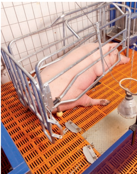
The farrowing frame is closed