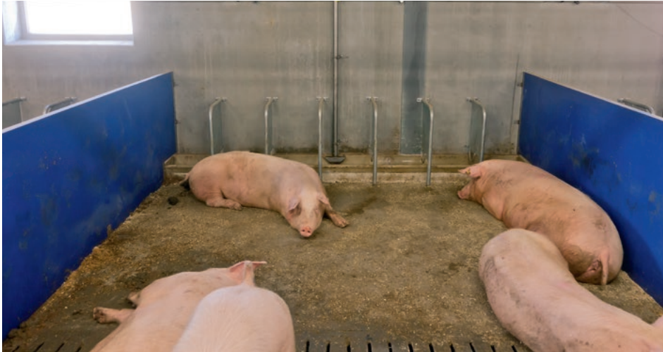
Group pen with ample freedom of movement for the sows