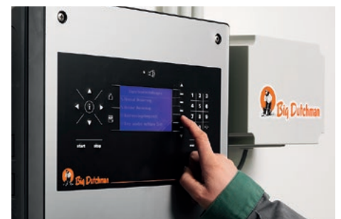
CallMatic pro station computer in the aisle

makes for better accessibility (animal-free area) so that adjustments are easily possible.