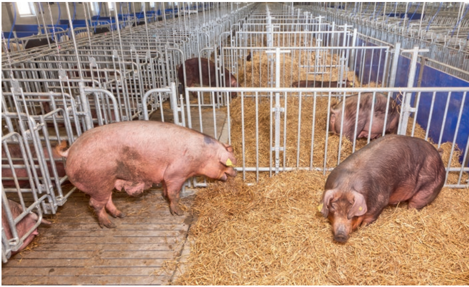
Free-access stall »Easy Lock« with straw bedding