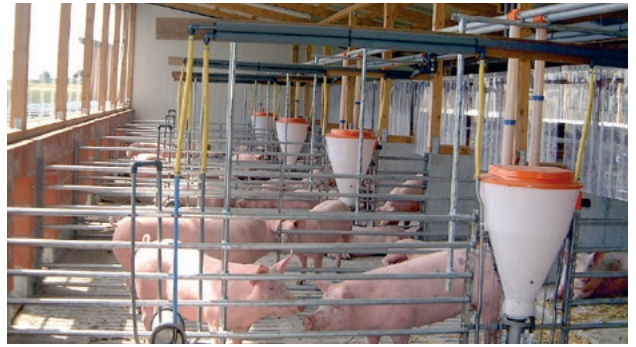
Eating and activity area