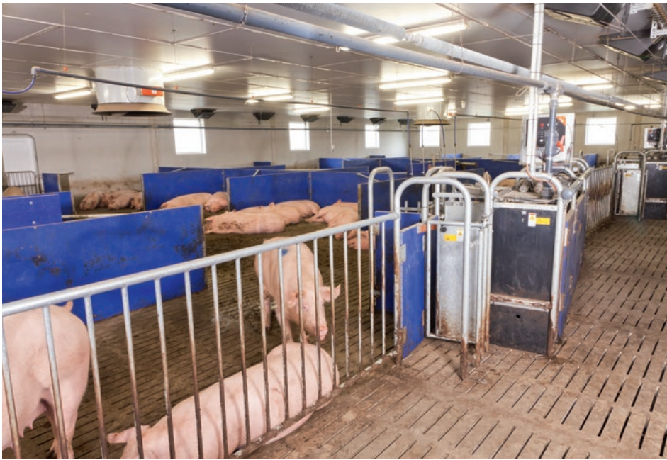
View of a waiting area equipped with the computer-controlled ESF station CallMaticpro