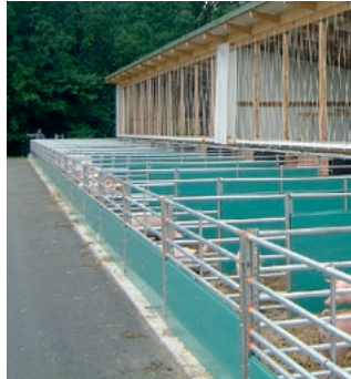
Finishing house with open run

Offering pigs an open run is another step towards increased animal welfare and more comfortable pigs. The open run contributes to a clear distinction between the different areas of the house: lying, eating and activity area. At the same time, the pigs are offered additional incentives to move and play. Furthermore, the open run creates a new climate area which differs from the warm house and thus improves the pigs' health and well-being.