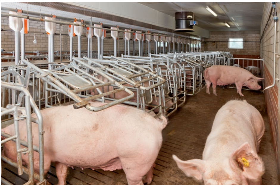
Free-access stall »BD« – the sows decide when to stay in the stall and when to move around in the group