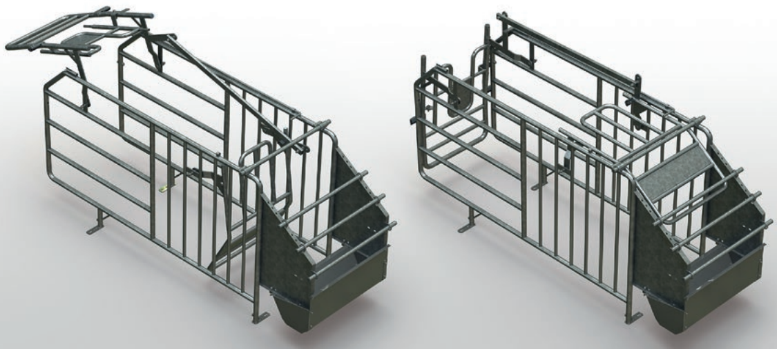
Free-access stall »BD« open – the sow enters the stall and closes it by herself; stall »BD« closed – the sow has easy access to the trough

The »BD« stall is entirely free access with the sow locking herself in and releasing herself from the stall at any time. The rear gate can be locked briefly for cleaning out or for insemination. The stall has a specially developed optional rear gate to make insemination easy.