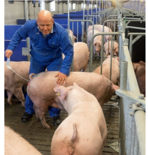
Good stimulation is the key for a successful insemination

The free-access stalls »BD« and »Easy Lock« developed by Big Dutchman provide sows with the advantages of animal-friendly housing in groups and ample freedom of movement. They can be used in the service area and in waiting areas.