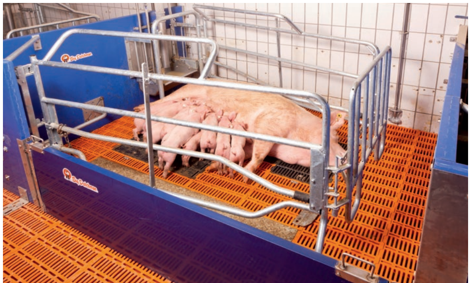
BD free-movement pen with opened farrowing frame → more freedom of movement for the sow