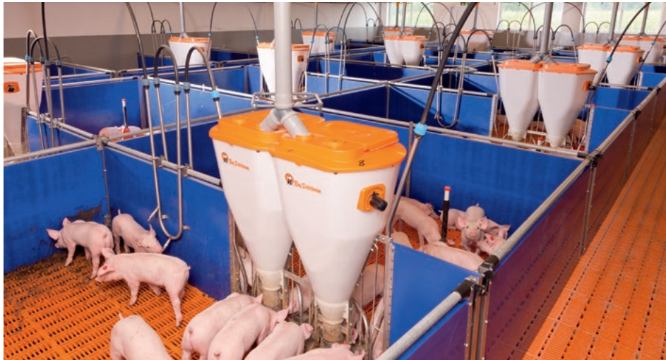
Piglet rearing house with much daylight and playing chains

Big Dutchman piglet rearing pens are equipped either completely or partially with our animal-friendly and anti-slip plastic flooring system. Rounded edges protect the piglets against injuries. The optimum solid-to-void ratio ensures good manure penetration, thus keeping the floor clean and promoting healthy piglets. The slats are available in two different sizes and can also be delivered with a slatted area of only ten percent. The penning system consists of flexibly usable, dimension-independent plastic partitions. BD penning is both durable and easy to clean. Steelwork which comes into contact with the floor is all stainless.