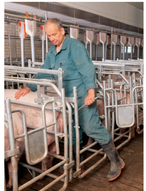
Integrated insemination door – easy access to the sow