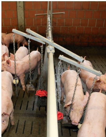
Swing with different playing chains

The foraging tower is filled with organic material, e.g. short straw. The pig nudges the material from a small, adjustable gap between the container and the plastic base on which it is fixed. The tower can either be installed as stand-alone or integrated into the pen partition.