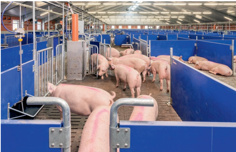
Call-Inn pro – computer-controlled sow feeding

Our experts will be glad to provide you with detailed information.