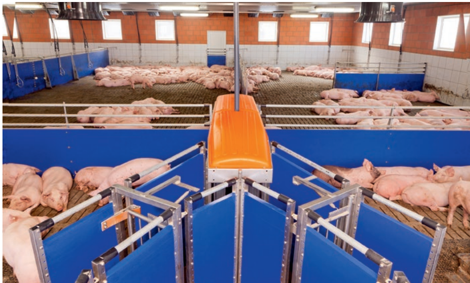
TriSort pro – much freedom of movement and many resting spaces in a house brightly lit by daylight

Big Dutchman piglet rearing pens are equipped either completely or partially with our animal-friendly and anti-slip plastic flooring system. Rounded edges protect the piglets against injuries. The optimum solid-to-void ratio ensures good manure penetration, thus keeping the floor clean and promoting healthy piglets. The slats are available in two different sizes and can also be delivered with a slatted area of only ten percent. The penning system consists of flexibly usable, dimension-independent plastic partitions. BD penning is both durable and easy to clean. Steelwork which comes into contact with the floor is all stainless.