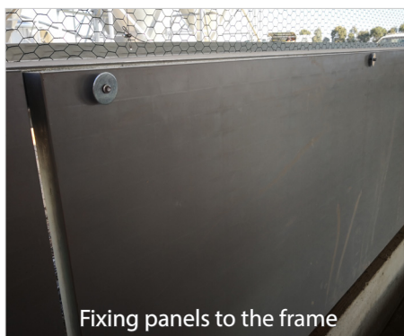
Fixing panels to the frame