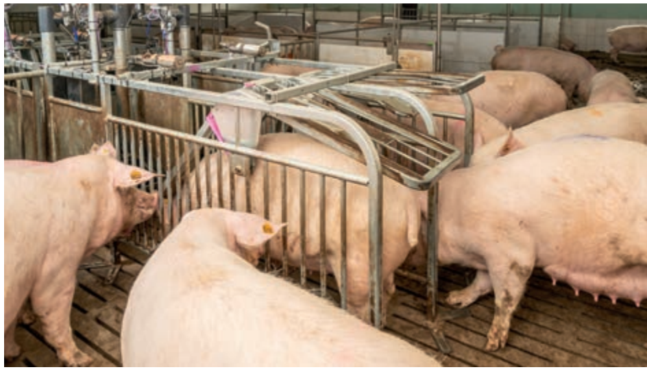
Individual feeding of every sow in a protected space

The 510 pro station controller can control up to ten feeding stations. It is installed directly in the aisle or in the office. With our clever BigFarmNet technology and the mobile app, you can control the feeding system and the ESF stations directly in the barn. Monitoring and managing animal, feeding, climate and other data is of course also possible, even when you are not on the farm.